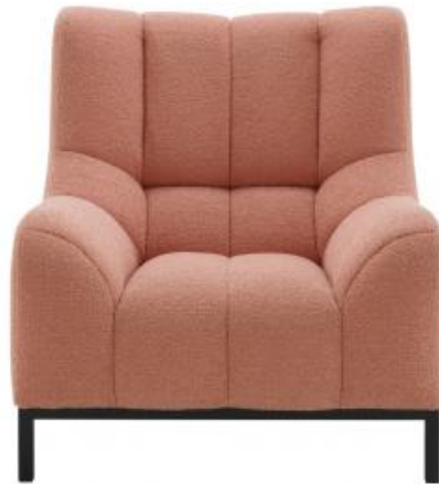
ARMCHAIR LACQUERED METAL BASE