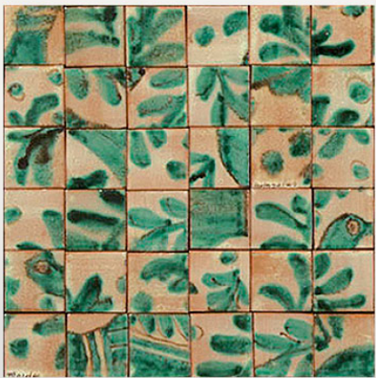
PML062, maiolica acquerellata/watercoloured majolica cm 7x7