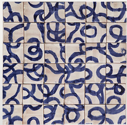
PML032, maiolica acquerellata/watercoloured majolica cm 7x7