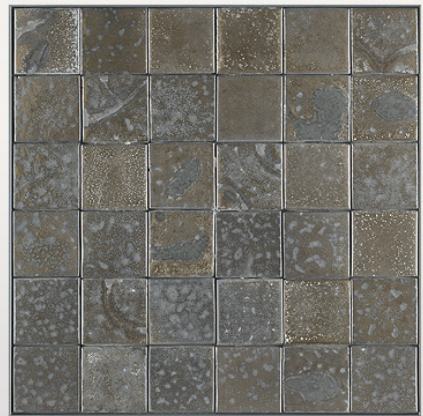
PMD121, majolica dipinta con colori ossidati/Majolica painted with oxidized colours cm 7x7