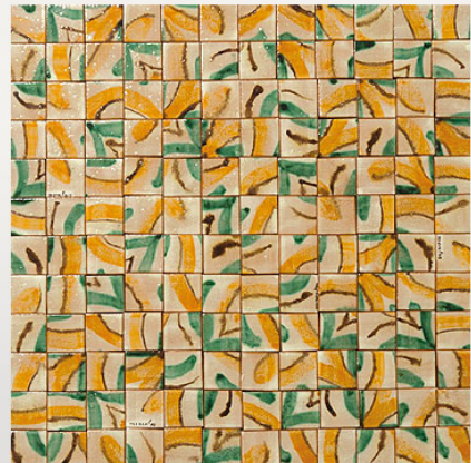
PMS112, maiolica acquerellata/watercoloured majolica cm 3,5x3,5