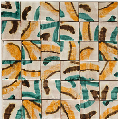
PML112, maiolica acquerellata/watercoloured majolica cm 7x7