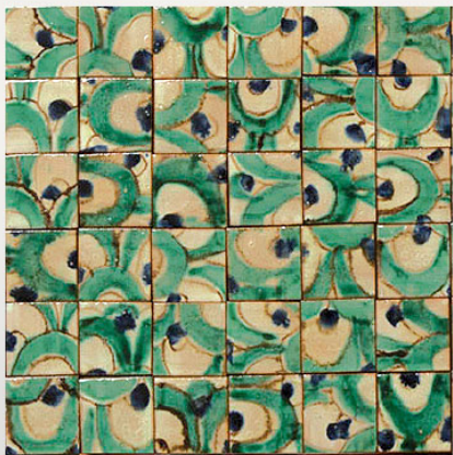
PML122, maiolica acquerellata/watercoloured majolica cm 7x7